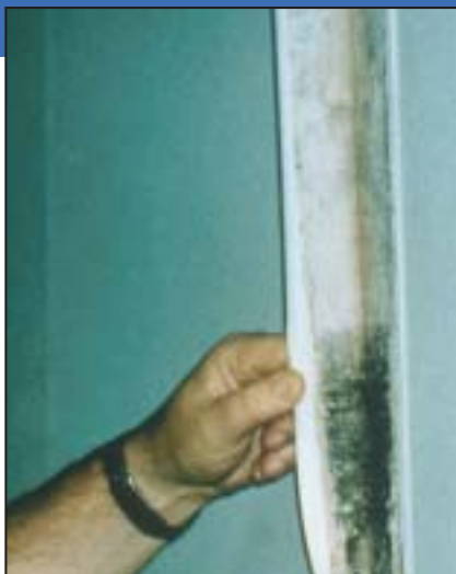
Mold growing on the back side of wallpaper.

Suspicion of hidden mold You may suspect hidden mold if a building smells moldy, but you cannot see the source, or if you know there has been water damage and residents are reporting health problems. Mold may be hidden in places such as the back side of dry wall, wallpaper, or paneling, the top side of ceiling tiles, the underside of carpets and pads, etc. Other possible locations of hidden mold include areas inside walls around pipes (with leaking or condensing pipes), the surface of walls behind furniture (where condensation forms), inside ductwork, and in roof materials above ceiling tiles (due to roof leaks or insufficient insulation).